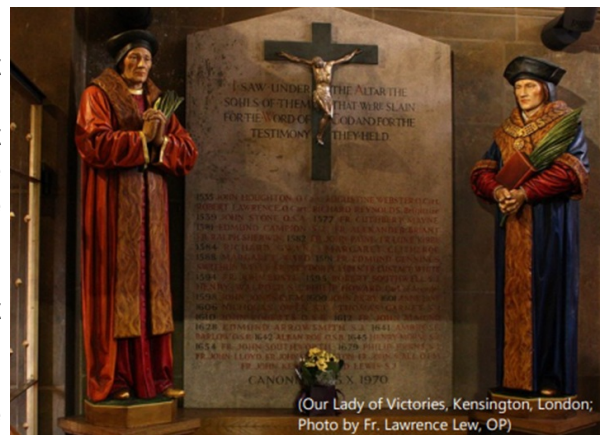
(Our Lady of Victories, Kensington, London;)

It is fitting that these men share a feast day, because they were both Englishmen martyred within two weeks of each other. They were martyred for the same cause (religious freedom) on the same occasion (defending the sanctity of marriage and Papal authority against State usurpation) and at the hands of the same man (King Henry VIII).